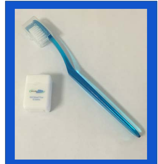
Toothbrush and Floss